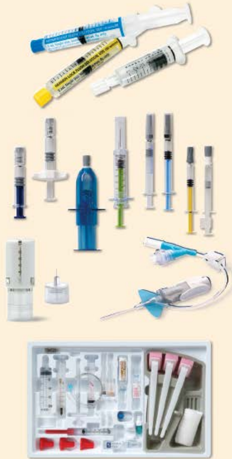
BD Medical Delivery