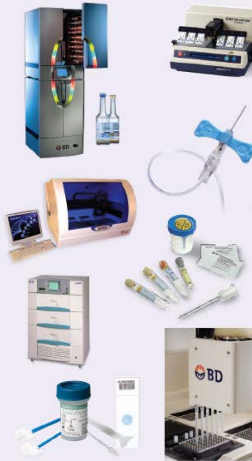
BD Diagnostics Diagnosis