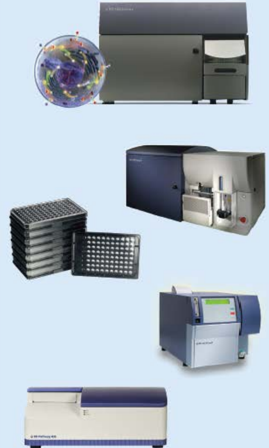
BD Biosciences Discovery and Development